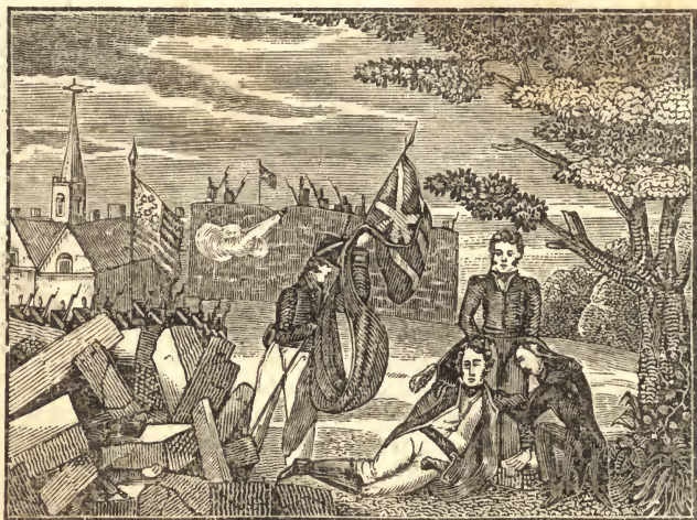
TAKING OF YORK, AND DEATH OF GENERAL PIKE.